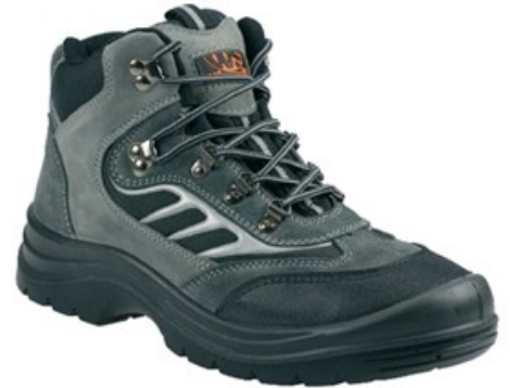
Safety Boot: SS605 £22.00