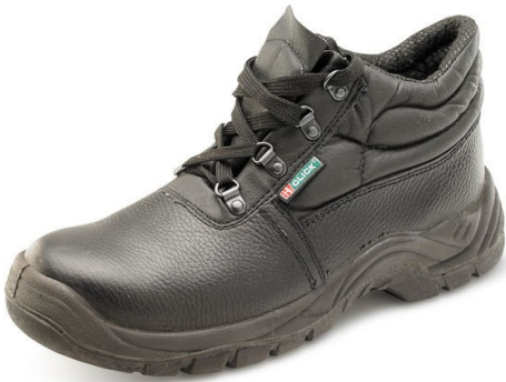
Safety Boot: CHUKKA £18.00