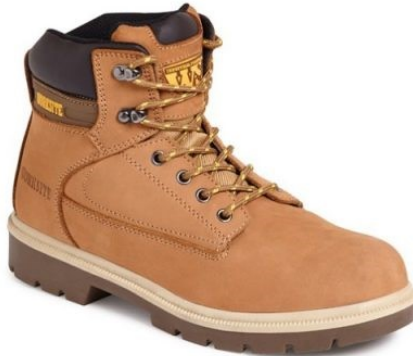
Safety Boot: WSITE TAN £28.00